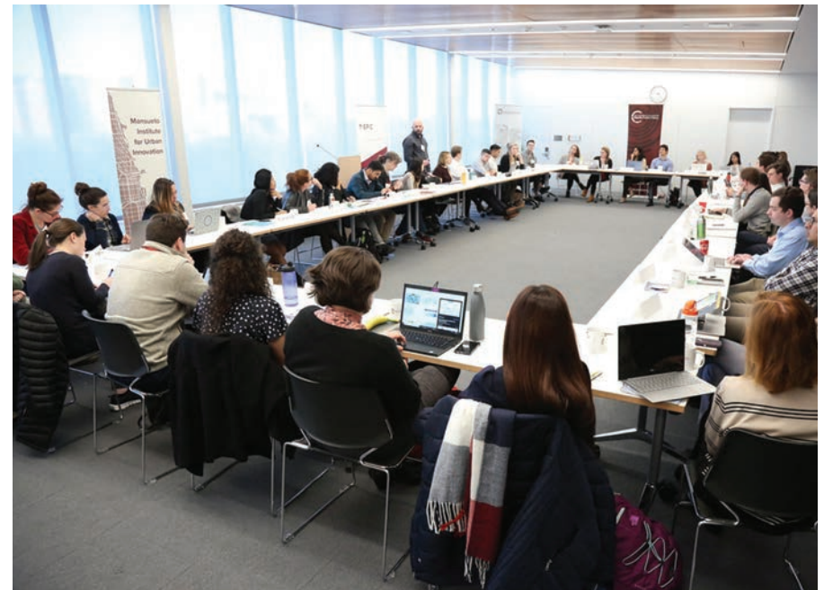
Student participants in IPSS 2020: City Resilience and Climate Change.