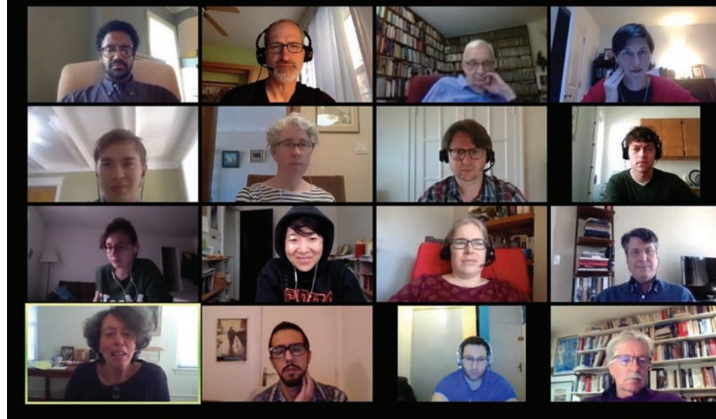
The May 15 session of the Workshop on Modern France and the Francophone World.