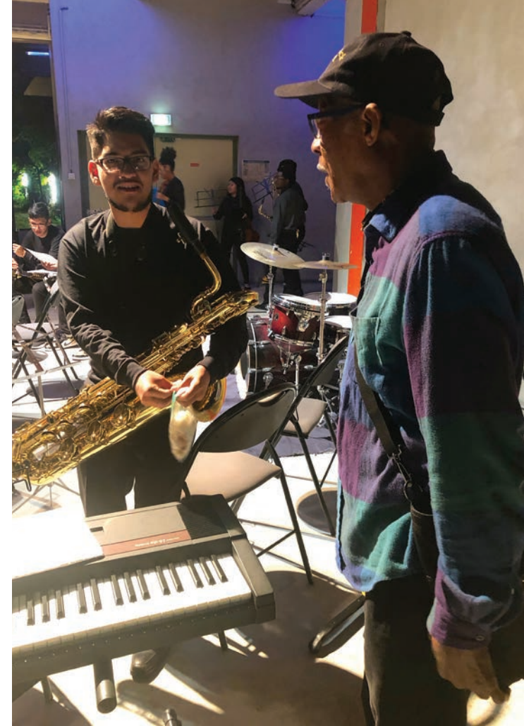
Preparations for a performance at La Dynamo in Pantin.

Four of the students in the group had participated in a similar trip to Paris in the fall of 2017, also made possible by invitation and with principal sponsorship from the France Chicago Center. For