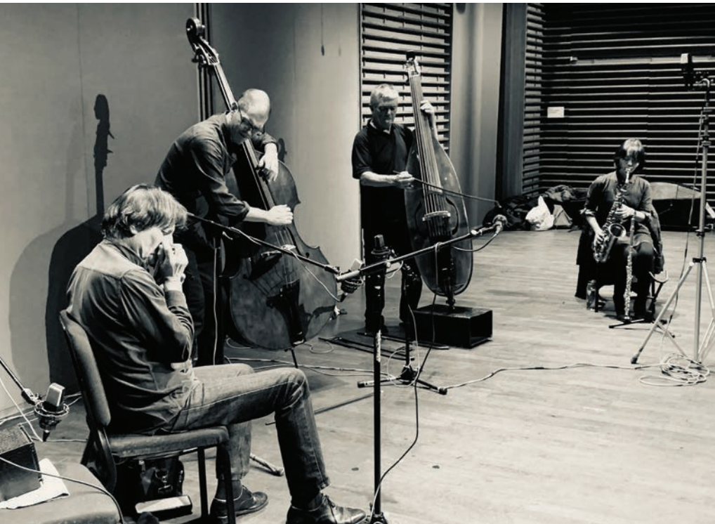
November 9 performance by the Bridge 2.02.