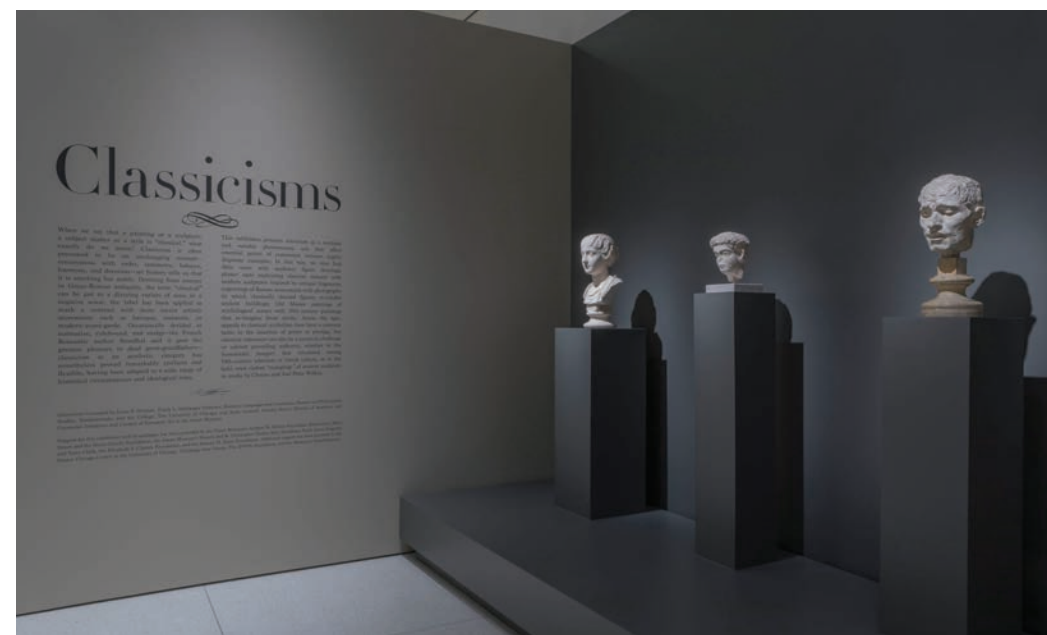
(below): Installation view of Classicisms at the Smart Museum of Art.