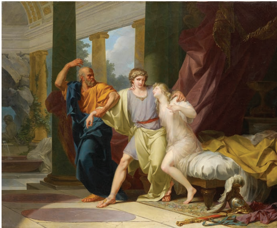
Jean-Baptiste Regnault, Socrates Tearing Away Alcibiades from the Embrace of Sensuality , 1785, Oil on canvas. Smart Museum of Art, The University of Chicago, Purchase, The Paul and Miriam Kirkley Fund for Acquisitions, 2013.31.

This exhibition seeks to explode the idea of classicism as an unchanging ideal, and features 70 objects spanning diverse genres, eras, and media—paintings, ancient and modern sculpture, cast plaster replicas, and works on paper. Together with a scholarly catalogue, the exhibition traces classicism's meanings across the centuries from varying artistic, cultural, and ideological perspectives to reveal a multifaceted concept with a complicated history.