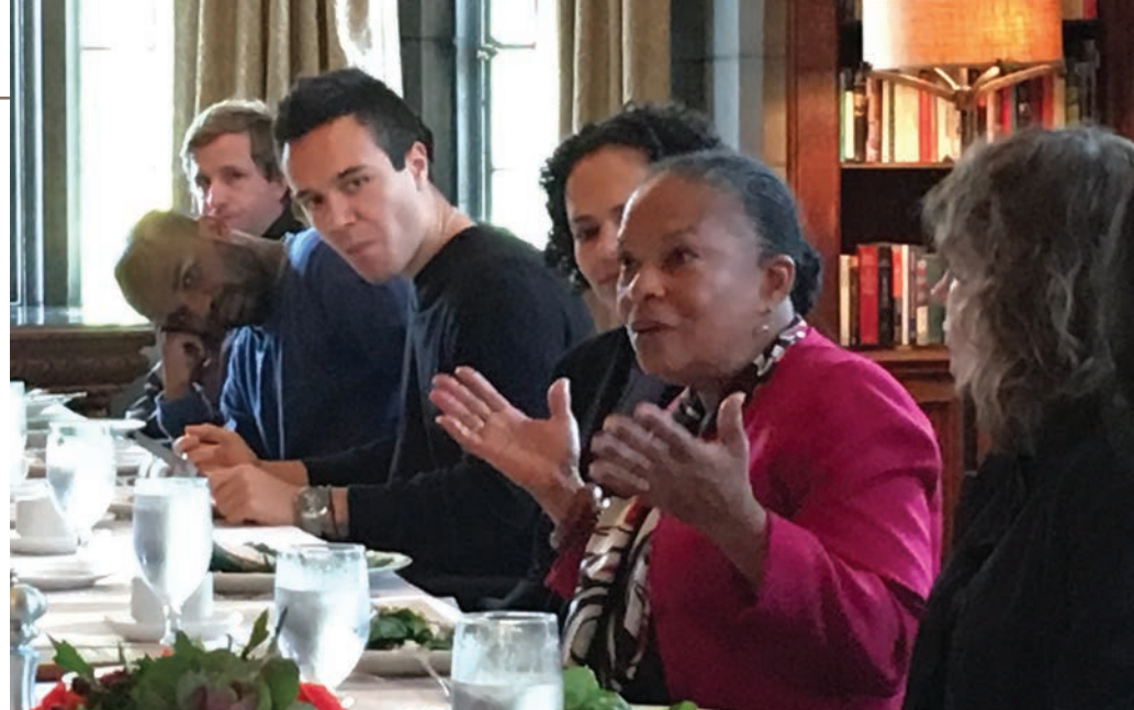
Christiane Taubira (former French Minister of Justice) engaged in conversation over lunch with UChicago students, faculty, and Consular officials.

In 2017, the FACCTS program received a total of 25 applications, with applicants requesting a total of $545,766. Fifteen projects were selected—seven in the Physical Sciences, five in the Biological Sciences, two at Argonne National Laboratory, and one at Fermilab—each receiving commitments ranging from $7,200 and $24,900. A total of $241,400 was committed to the projects described in the table on page 10.